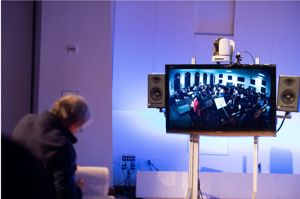
Image 1. Image: Michael Tilson Thomas leads an Atlanta Symphony Youth Orchestra rehearsal over Internet2's LOLA from the New World Symphony campus in Miami Beach, FL.