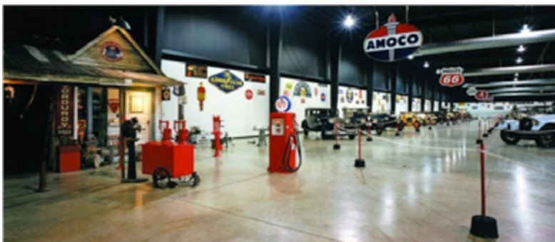
Figure 3. Tupelo Automobile Museum (Visit Mississippi 2009)

The National Corvette Museum in Bowling Green, Kentucky, has installed 23 cameras across its facilities. Inside, cameras film the museum spaces and its collections, whereas outside cameras focus on a racetrack. All video is visible on the museum's official website. Although the purpose of the outside camera is clear, allowing any car aficionado to watch historic car races, that of inside cameras for the online audience is less obvious. One possible use is that during visiting hours, internet users can monitor the flow of visitors, how they interact with cars, and even take pictures of relatives or themselves while visiting the museum. 14 In addition, by filming when the museum is closed to the public, cameras register the staff while changing settings, moving and cleaning cars, and working on operations of mechanical maintenance. All these activities may be interesting for the museum