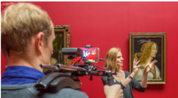
Figure 1. A technology that allows you to stream live events (Kate Duggan 2017)